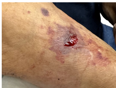
Partial flap loss which cannot be repositioned to cover the wound bed