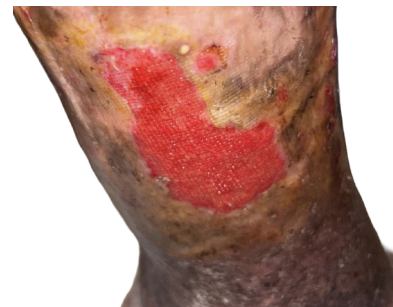
Total flap loss exposing the entire wound bed

ISTAP™ is an Official Interest Group of NSWOCC®